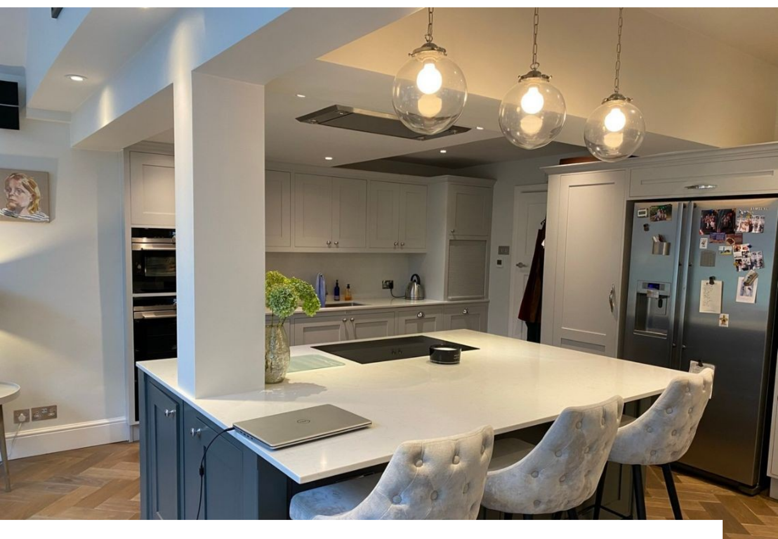
LON1013 South West London: Executive Home & Garden For Filming Executive family home with openplan living space available for filming and photo shoots.